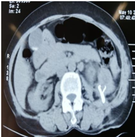
Fig 1: Axial cut section of non-contrast computed tomography showing wing part of broken malecot catheter in renal parenchyma

Given its location in lower pole of kidney, decision was taken to remove part of tube percutaneous nephrolithotomy. The patient was placed in lithotomy position under general anesthesia. Ureteric catheter was placed in left ureter then patient changed to prone position. Renal anatomy was delineated on fluoroscopy with giving diluted contrast. Part of stem and flower of malecot catheter was in perinephric space near inferior pole with tip embedded in renal parenchyma. So inferior calyceal puncture was done under fluoroscopy. Figure 4 is the fluoroscopic image showing puncture needle and renal calyceal anatomy with retained malecot flower. Tract progressively dilated until 30F Amplatz sheath was placed.