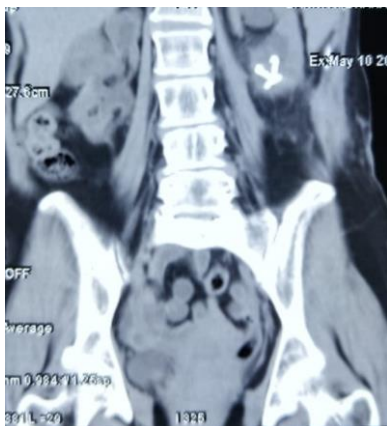
Fig 3: Coronal cut section of non-contrast computed tomography showing part of broken malecot catheter in lower pole of left kidney