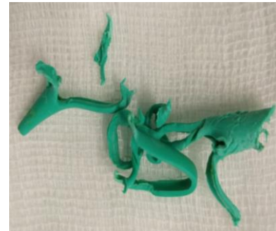
Fig 5: Removed specimen image of part of broken malecot catheter

All parts of malecot catheter were removed after cutting fibrosis and tissue ingrowth. Figure 5 is the removed part of malecot catheter. Final nephrostogram displayed no any retained fragment of malecot catheter without any subsequent bleeding. A DJ-stent was placed. Recovery was without incident and she was discharged the next day.