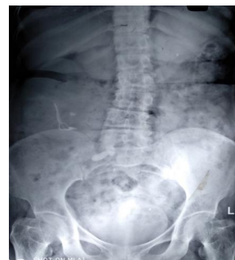
Fig 6: X-ray kidney ureter bladder showed retain part of malecot nephrostomy tube

Case 2: A 55 year female, known diabetic presented earlier at an outdoor center with fever, right flank pain and decrease urination found on evaluation to have right emphysematous pyelonephritis. She underwent right percutaneous nephrostomy drain. After complete control of blood sugar and recovery from emphysematous pyelonephritis malecot nephrostomy tube was removed but the tube came out broken. The retained part of the malecot tube was found to be impacted and could not be taken out. It was found to be impacted due to ingrowth of granulation tissue into the eyes of the Malecot catheter. X-ray kidney ureter bladder showed retain part of malecot nephrostomy tube (Figure 6). A x- ray intravenous urography was done which revealed the “wing” part of the nephrostomy tube engaged inside the renal parenchyma and excreting kidney (Figure 7).