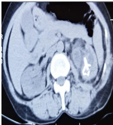
Fig 2: Axial cut section of non-contrast computed tomography showing broken malecot catheter completely in renal parenchyma