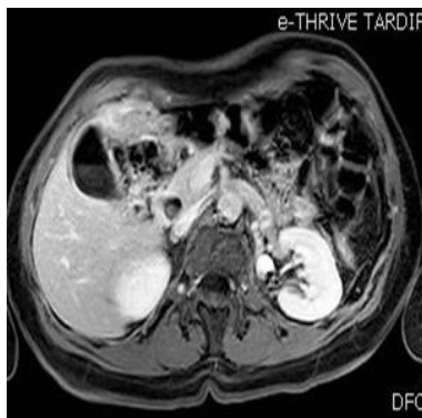
Fig 2: Biliary MRI with dilation of the overlying bile duct