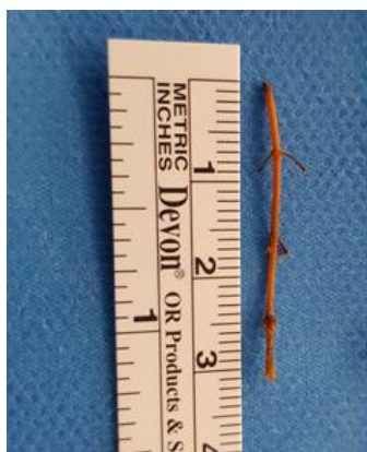
Fig 4: Sprig of thyme (after extraction)