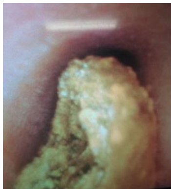
Fig 3: Choledochous lithiasis