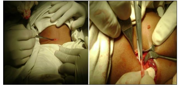
Fig 2: Open repair of inguinal hernia

They asserted that their approach yielded outstanding outcomes, with recurrence rates ranging from 0 to 1.2% [15]. There are two distinct methods for treating paediatric hernias: open repair and laparoscopic repair. Laparoscopic surgery involves many procedures, such as purse string or z-suture. The objective of this study is to evaluate the outcomes and complications of open inguinal hernia repair in children with two laparoscopic repair techniques: Z suture and purse string. The study will focus on both early and late issues. Based on this study, it is evident that LH is a viable alternative to open repair. However, further research is required to establish a definitive superiority of one treatment over the other. This review seeks to compare LH with OH in terms of surgical time, patency of the contra-lateral deep ring, post-operative complications, and recurrence rates.