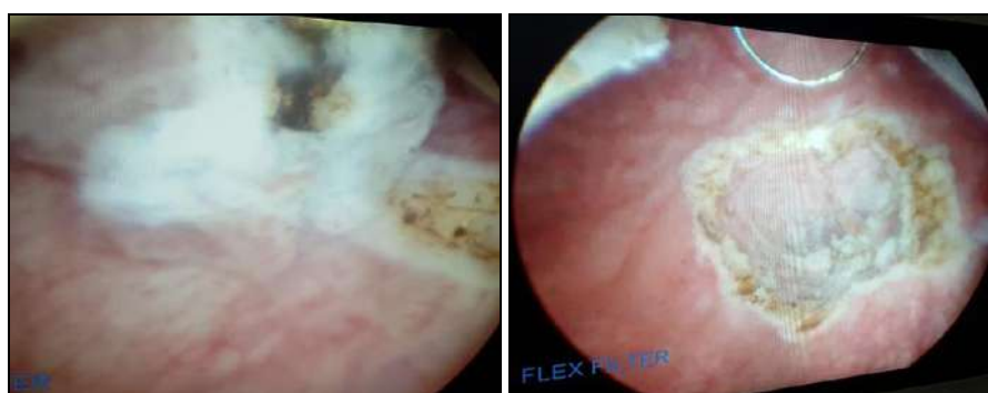
Fig 2: Enbloc dissection technique of TURBT Endoscopic intraoperative pic