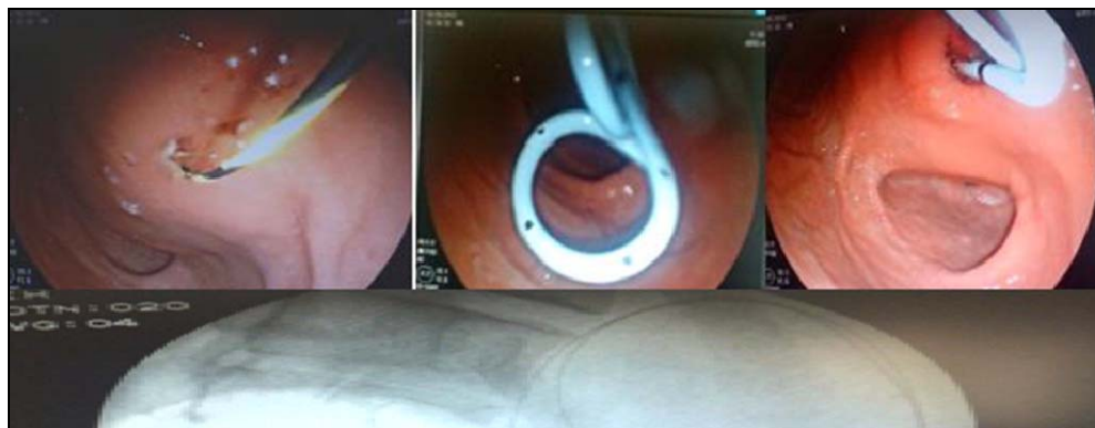
Fig 3: Endoscopic drainage of pseudocyst and fluoroscopic picture showing the guide wire curled inside cyst cavity.