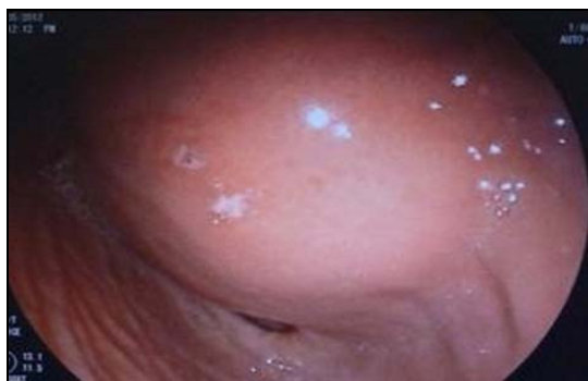
Fig 1: Pseudocyst of pancreas

Hence a multidisciplinary team comprising of therapeutic endoscopist, interventional radiologist and pancreatic surgeon should be involved in all cases [5]. In this study we would be throwing light on the, various treatment modalities and also study the overall morbidity & mortality of pancreatic pseudo cyst in a tertiary care hospital.