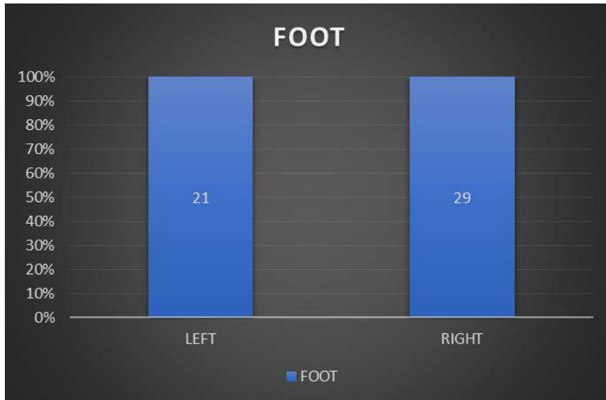
Graph 2: Commonly involved leg in Foot Ulcer

In my present study, the ulcer/gangrene/abscess is commonly located in dorsal aspect of foot 16 cases (32%) followed by plantar aspect 12 cases (24%) and complete involvement in 10 cases (20%).