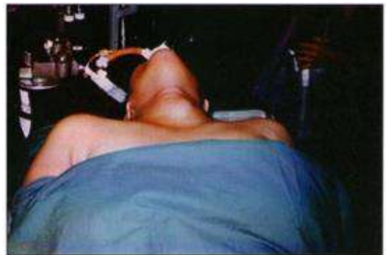
Fig 2: Position for thyroidectomy