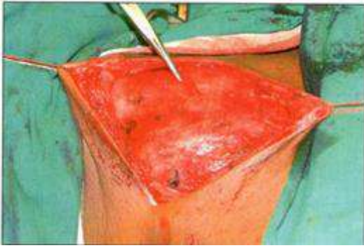
Fig 5: Flaps raised exposing the strap muscles.