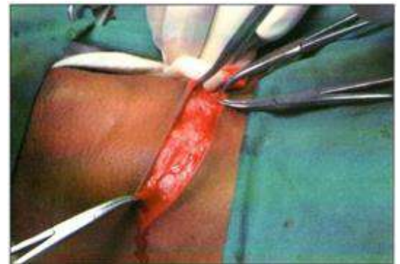
Fig 3: Incision for thyroidectomy