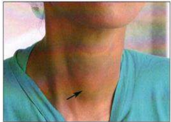
Fig 1: Clinical picture of solitary nodule of thyroid

From the literature, the incidence of malignancy in thyroid nodule ranges from 5% to 30%. From the present study, the incidence found to be 10.9%, which is comparable with the study done by Deshpande A et al [16].